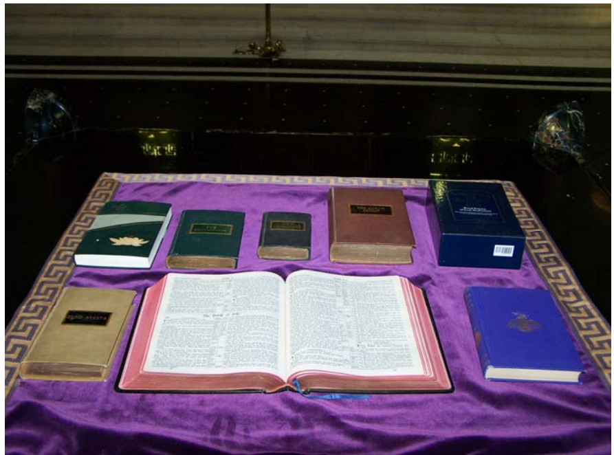
Altar in the main lodge room of the House of the Temple.

Brother Tofique Fatehi Lodge Al-Ameen No. 1412 (Grand Lodge of Scotland) Bombay, India